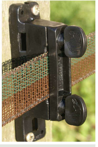
Sold only in black colour in Canada, this accessory is intended for posts on the line only and without tension.

This insulator fits all kinds of posts, but the attachments are different for wooden, metal or tree posts: