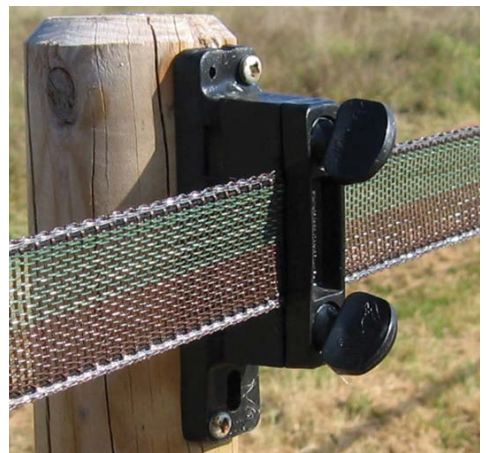
Option 1 #45V