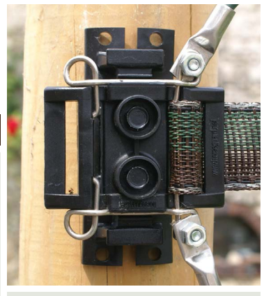
#BP32 Small Tensioner