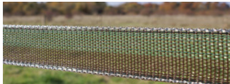
HorseGuard Bi-polar Tape colour code