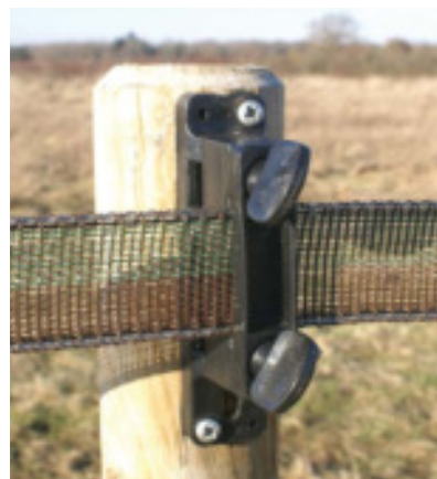
Line post insulator #8bl on wooden or metal post

Unroll the tape to fasten it by hand between the tensioners, respecting the colour code (green / brown). Tighten it strongly. Then install the tape in each line insulator closing its cover with the «banjo» screws provided (the empty space at the end of the screws is by design).