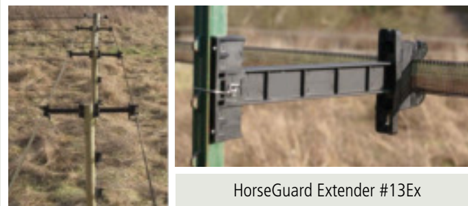
HorseGuard Extender #13Ex