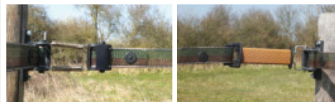
Spring Tensioner #BP38 + Gate handle #BP13A