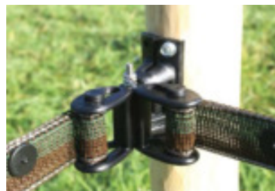
Tensioner/Connector #BP37 - Onto wooden or metal post