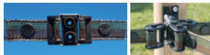
Splicer Buckle #BP34 - Extra Buckle #BP37T